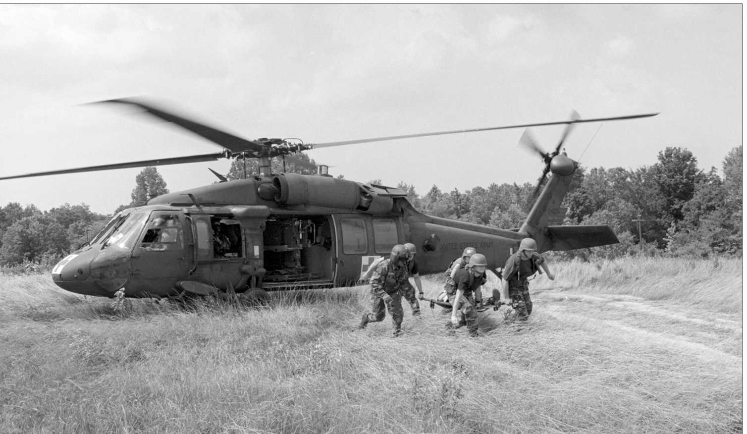
ABOVE: Turkey Trot included a medevac helicopter supplied by the U.S. Army's 101st Airborne Division at Fort Campbell, Ky.